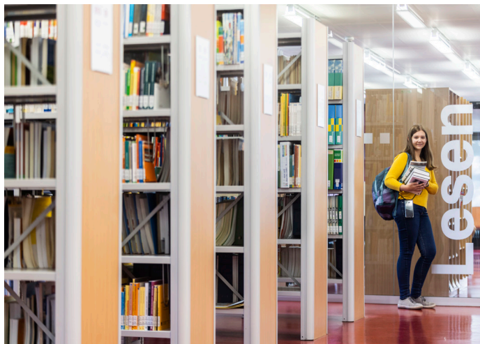
The university library offers a wide range of literature

As a central establishment we mainly provide members of the Karlsruhe University of Education with literature to support their studies, teaching and research. However, anyone with scientific and professional interests is welcome to use our services.